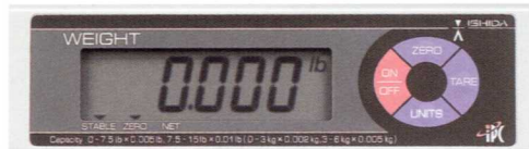
Large Display Panel

Answering the call for simplicity, portability and reliability...the iPC delivers exceptional all-around performance.