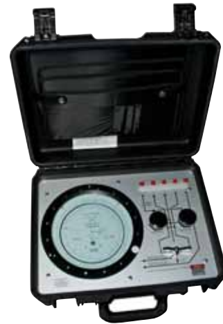
Portable Pneumatic Calibrator Series 65-120

A pressure relief valve protects the mechanism (capsule); pressure up to 90 psi will not damage the mechanism nor affect accuracy. A built-in relief valve and a flow restrictor