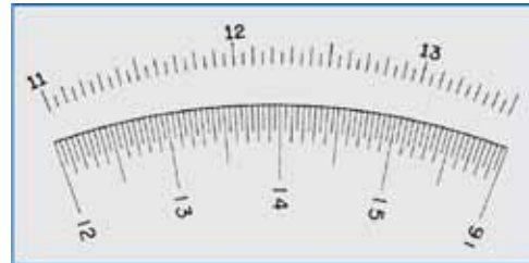
WIKA (top) and competitive scales of the same range.

Sharply defined graduations, a 45-inch (1140 mm) scale length over two pointer revolutions, and a knife-edge pointer facilitate precise readouts. All scale calibrations are individually plotted and hand marked to produce a dial custom fitted to the pressure element and mechanism of that gauge.