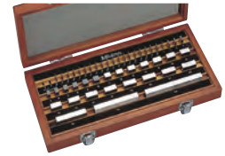
Steel 47-block set