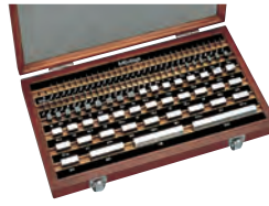
Steel 103-block set