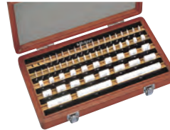
CERA 56-block set