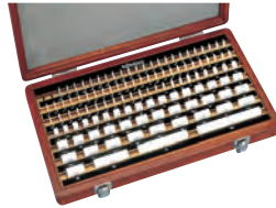
CERA 112-block set