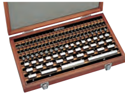
Steel 112-block set