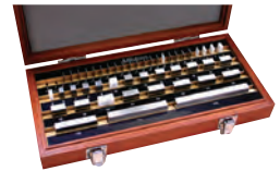
CERA/Steel combination 47-block set