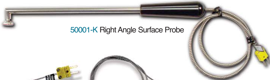
50001-K Right Angle Surface Probe