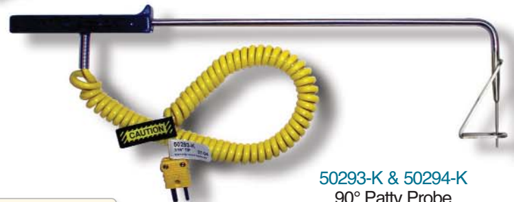
50293-K & 50294-K 90° Patty Probe