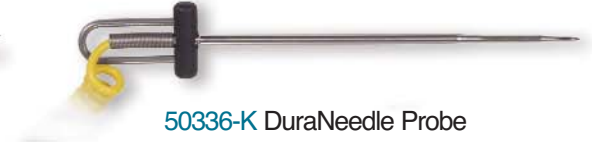
50336-K DuraNeedle Probe