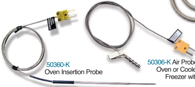
50360-K Oven Insertion Probe