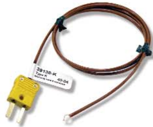
39138-K Bare Tip Probe