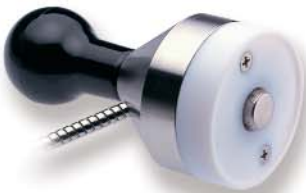
50014 -K Weighted Griddle Probe