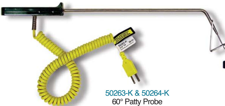
50263-K & 50264-K 60° Patty Probe