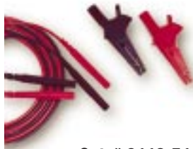
Cat. # 2118.51 Voltage Leads, (2) with clips, 5ft. for Models L205, L230, L260, L410 & L430