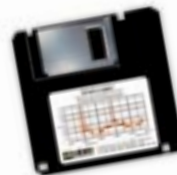
Cat. # 2114.26 Simple Logger® Software Upgrade for all models (Receive software upgrade notices when warranty registration is on file)