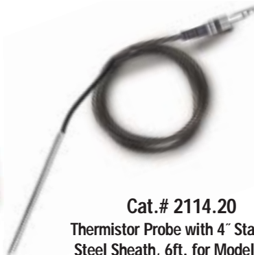
Cat. # 2114.20 Thermistor Probe with 4" Stainless Steel Sheath, 6ft. for Model L605