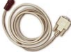
Cat. # 2114.25 Cable 6ft. DB9F/Circular Connector (for AL series)