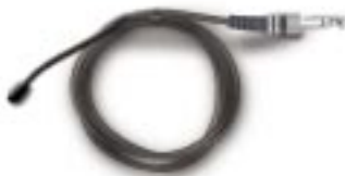
Cat. # 2114.19 Thermistor Probe with Epoxy bead, 6ft. for use with L605