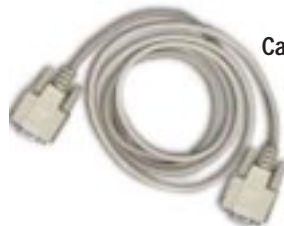
Cat. # 2114.27 Cable 6ft. DB9 M/F Replacement for all Models (except AL Series)