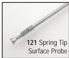
121 Spring Tip Surface Probe

Custom Probes for Your Applications Contact Wahl for custom-made probes to your specifications, or let us help you design the right probe for your application.