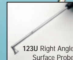
123U Right Angle Surface Probe