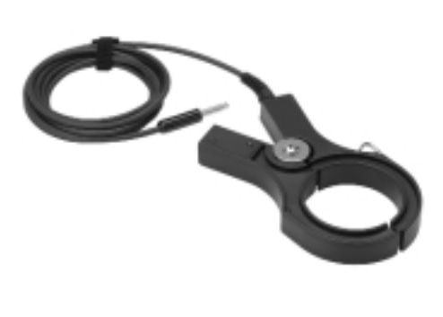
Inductive Signal Clamp For use on live lines and when a direct connection is not possible