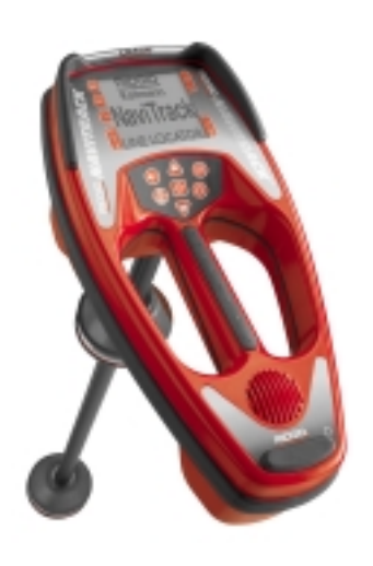
NaviTrack Make locating easy and work with confidence