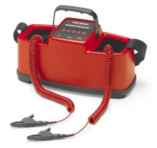
NaviTrack Transmitter Use in conjuction with NaviTrack to locate trace wires, metallic waterlines, phone lines, cable TV lines, and other metalic lines.